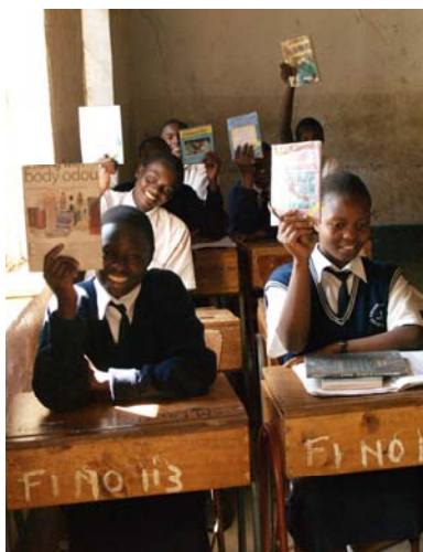
Essaba students display books recently donated by KEEI..

Recently KEEI made significant contributions to two Bunyore area schools- Ebusiloli and Essaba Secondary Schools. Each school received $3000 worth of books to inaugurate their new libraries. The libraries were built by the school communities with assistance of the National Constituency Development Fund. KEEI is proud to help the schools get their new libraries functioning. Since the dollar goes far in Kenya, we were able to provide each school with over 500 books including over 80 different titles. Ebusiloli's new library now holds approximately 2500 volumes. The school library far surpasses most of the other schools in the area. We anticipate that the contributions will provide a significant academic boost to the school community in academic development and in school morale. Thank you to all of you who helped make this possible.