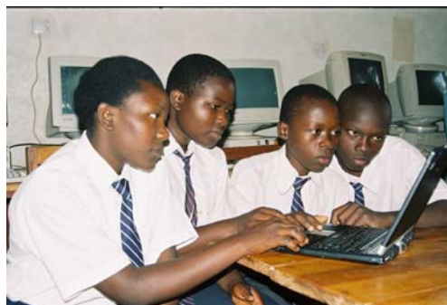
Ebusiloli students experiment with one of laptops - recently donated by The Benjamin School.