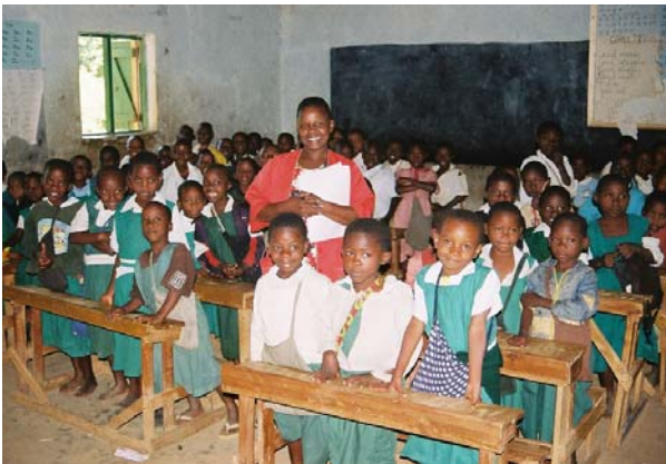
Teacher and students greet visitors at Essaba Primary .