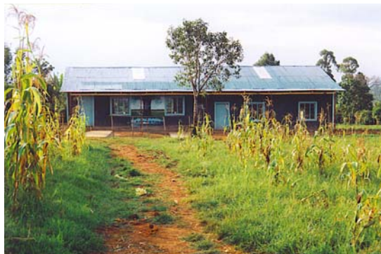
See previous Newsletter or our website: www.kijana.org for the story and details of the revival of Mwituha Secondary School.

Kijana Educational Empowerment Initiative