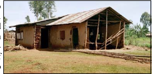
Crumbling old classrooms. Look for pictures of new classroom in our next newsletter.

Following upon our successes in recent years in improving the quality of the learning experience at Ebusiloli and Essaba community schools, KEEI has embarked upon expanding our efforts to several schools in the Bunyore region. At Ebbiba Primary School near Kima, in Bunyore, we have just begun work to construct two complete new classrooms. In March, when Jim Cummings visited the region and several schools, two of the lower primary classrooms were found to be almost collapsing. Some 50+ students learn in each of the mud classrooms, one of which was missing a wall. (pictured here) No water supply exists at the school and the community is unable to gather funds for significant improvements. KEEI has stepped in to demolish the old classrooms and build two new ones, which will hopefully serve as an inspiration to local government and other institutions of what is possible. We hope it will serve to provide a source of pride to young students and the community inspiring youth to greater heights.