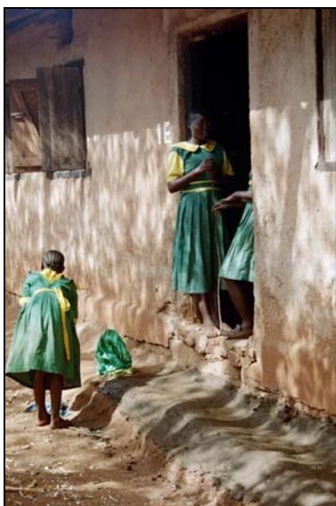
Primary students smearing walkway with cow-dung