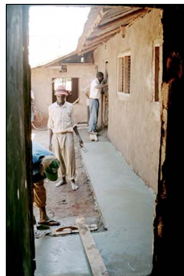
Students thank you for the new cement floors and walkways.

Thank You to all who have contributed at our last Cookout For Kenya or to our recent fund drive. Your contributions are already being put to work on the Ebbiba classroom project and are making a dramatic difference in several communities. We recently refurbished two classrooms at Esirulo primary school with your help. Mud and cow-dung floors have been replaced with cement. Students no longer have the weekly chore of smearing floors with dung. If you haven't given, please consider doing so. A small contribution will make a big difference in the lives of many young people. $20 for example will fund the construction of two student desks - each of which will seat up to three students.